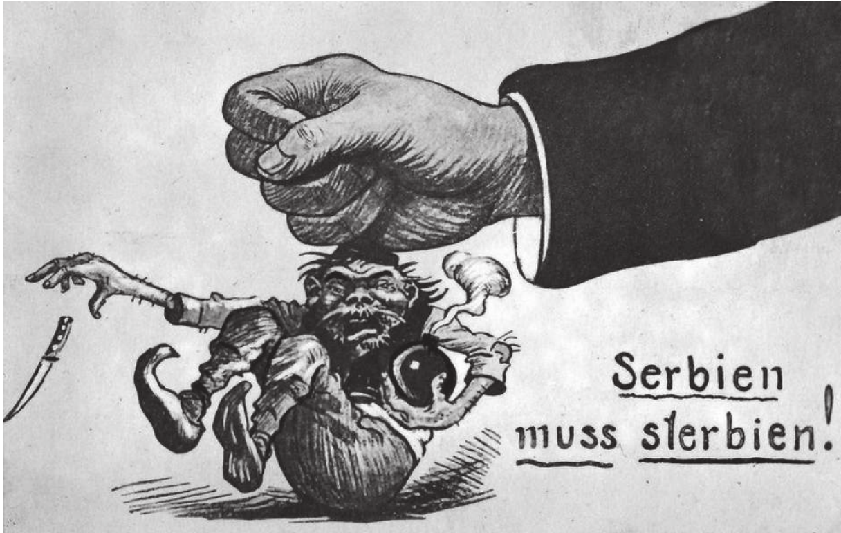
A postcard published in Austria in 1914 soon after the assassination of Franz Ferdinand. The words in the bottom right say 'Serbia must die!'